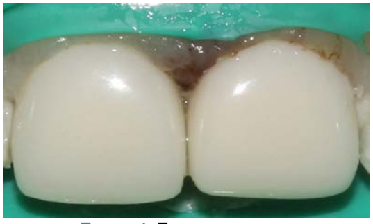
FIGURE 4. FINAL RESTORATION