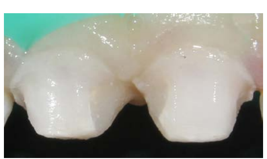
FIGURE 1. A SUBGINGIVAL PREPARATION IS LEFT.

Make incisal and vestibular cuts of approximately 1 mm depth and remove them with a round-end taper. Remove the interproximal contact points with a fissure bur. A subgingival preparation is left. (Figure 1)