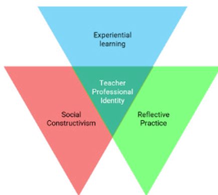
FIGURE 1. Conceptual model of teacher professional identity formation

Teacher professional identity is not stable but is formed through a dynamic interplay of reflection, experiential learning, and social interaction. This relationship can be more clearly illustrated through a conceptual model that maps how Schön's reflective practice, Kolb's experiential learning cycle, and Vygotsky's social constructivism intersect in shaping teacher professional development (see figure 1). Conversely, individual reflection, practical experience, and social influences shape and transform it (Ockerman and Bagui, 2024; Tang and Ye, 2023). Continuous learning produces a teacher identity that combines experience, social collaboration, and critical reflection on teaching practice. Therefore, understanding how professional identity emerges and develops provides important insights for supporting teacher professional growth and improving classroom instructional practices.