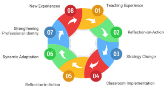
FIGURE 2. The cycle of reflection and change in teacher identity based on Schön's (1992)

The reflective thinking model shown in Windi's experience directly reflects the Reflective Practice theory proposed by Schön (1992). In this framework, Schön distinguishes two types of reflection that characterize true professionals: reflection-on-action and reflection-in-action. Reflection-on-action refers to the critical thinking process carried out after the action is completed as an effort to evaluate the successes and shortcomings of the practice that has been carried out. Meanwhile, reflection-in-action is the ability to think and adjust reflectively during the ongoing action process, allowing teachers to respond flexibly and appropriately to classroom situations. In Windi's learning practice, these two forms of reflection complement each other and form a continuous professional learning cycle (see figure 2). She reviews the effectiveness of the methods she uses and makes spontaneous adjustments based on direct interaction with students, the classroom atmosphere, or unexpected obstacles in implementing learning.