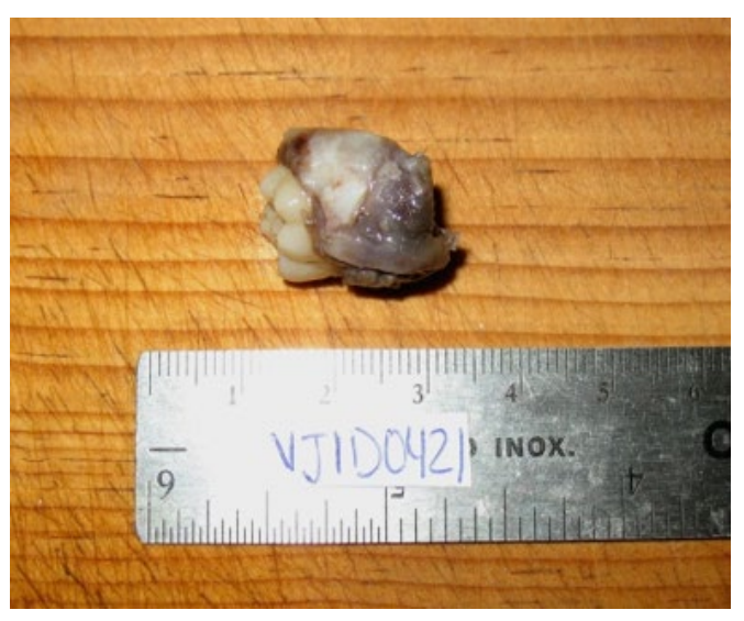
Figure 4. Extracted tooth with the cystic lesion.

Few studies have reported the presence of a dentigerous cyst in upper central incisors, or in mandibular first