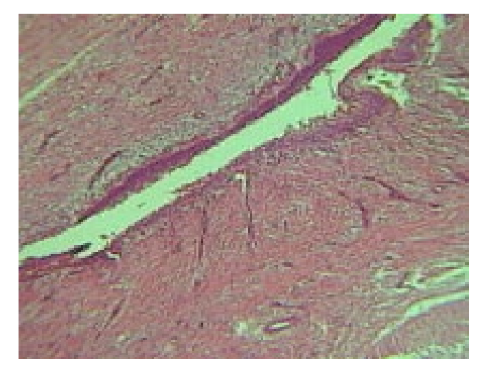
Figure 5. Histopahological section.