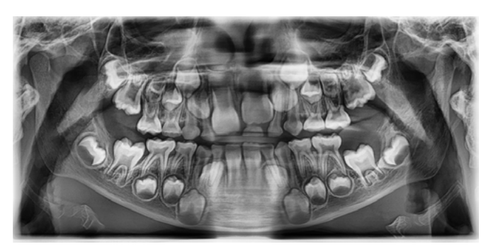
Figure 1. Panoramic radiography revealing an expansile radiolucent lesion related to the first molar in the left side.

Cone beam computed tomography (CBCT) showed an irregular hypodense area at the occlusal level of the germ of tooth 36, being unilocular and surrounded by a