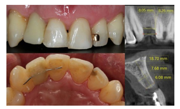
Fig. 1. Initial clinical and tomographic analysis.

Following thorough analysis of the case, the patient underwent the hygienic phase and was later asked to approve the performance of vertical GBR while simultaneously positioning the implant. This procedure was suggested to correct the vertical defect in the area and modify the zenith point concerning the other teeth in the aesthetic area. The patient accepted the suggested treatment and provided signed informed consent. The