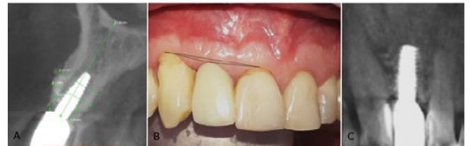
Fig. 3. A and C Final tomography. B. Clinical photo 3 years post-functional loading.

increase vestibular gingival thickness. The provisional implant was functional throughout the whole integral rehabilitation process. In October 2017 (13 months after initial positioning), the abutment was torqued to 20N, and the final crown was cemented in zirconium. Follow-up appointments were scheduled every 6 months. The peri-implant tissues were evaluated in October 2020 (3 years after functional loading) (Fig. 3).