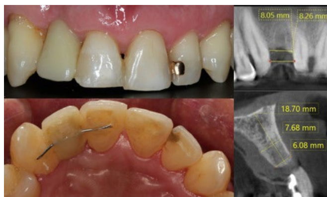
Fig. 1. Initial clinical and tomographic analysis.

Following thorough analysis of the case, the patient underwent the hygienic phase and was later asked to approve the performance of vertical GBR while simultaneously positioning the implant. This procedure was suggested to correct the vertical defect in the area and modify the zenith point concerning the other teeth in the aesthetic area. The patient accepted the suggested treatment and provided signed informed consent. The