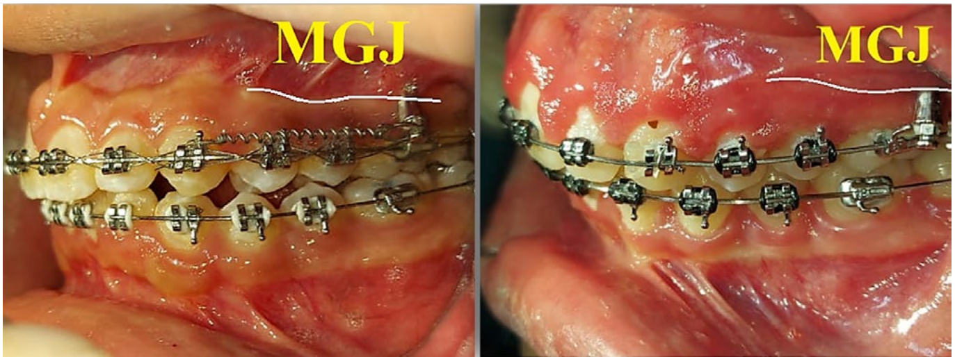
Fig. 3. IZC Miniscrew placed in movable mucosa (left) and in attached gingiva (right). The broken white line is the mucogingival junction (MGJ).

primary stability. In this regard, Liou et al. (38) evaluated 16 cone beam computed tomographies (CBCTs) to determine the area with the most favorable thickness of the IZC and found that it is located above the maxillary first molar (thickness from 5 mm to 9 mm). The same is found between 13 mm and 17 mm above the maxillary occlusal plane and can be reached directly by applying an angulation of 40° to 75°. Following of these references will prevent loss of anchorage and injury to the roots of the tooth and reduce irritation of the mucosa.