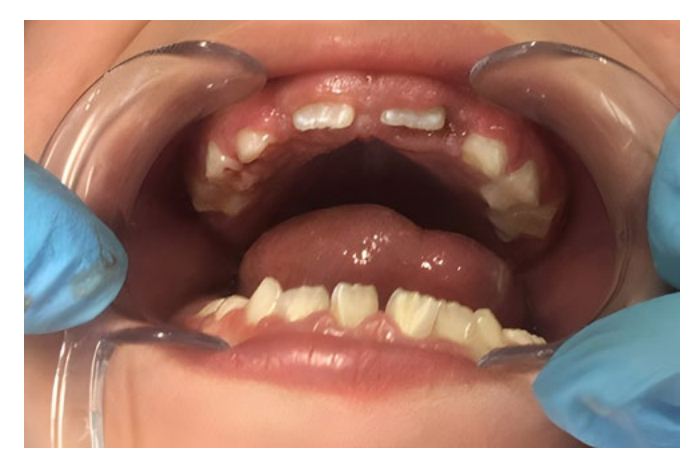
Figure 5. First control visit. Change in primary dentition.