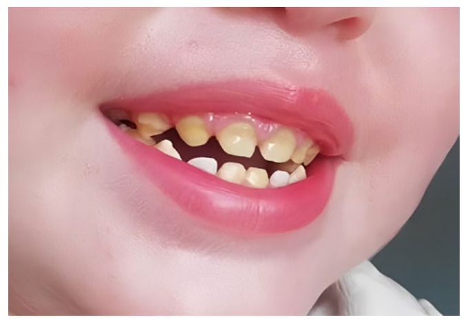
Figure 4. Yellowish primary dentition and open bite