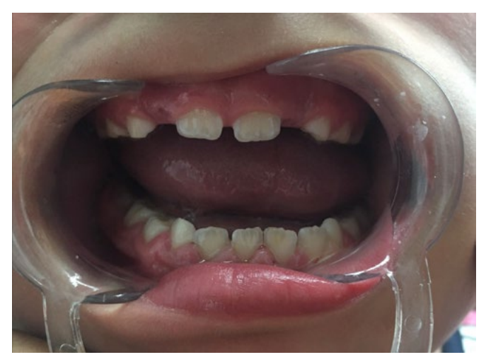
Figure 7. Enamel defects in erupted permanent incisors.

Behavioral problems and interruptive conduct created difficulties during clinical evaluation and dental management. At seven years old, the first permanent molar was absent and upper permanent central and lower central and lateral permanent incisors fully erupted, presenting delayed eruption. The enamel in dental units 11 and 21 showed white and creamy demarcated opacities and 31 showed a yellow demarcated opacity, all of them less than 1/3 of the extent in buccal surfaces, also 41 showed hypoplastic enamel in buccal surface (Figure 7), conversely to symmetrical hypocalcified enamel found in the primary dentition. The gingival tissues showed a hyperplastic appearance. The treatment planning for this enamel defect case was a nonsurgical approach with scaling, oral hygiene instructions considering the absence of dental caries and hypersensitivity, and limitations in the patient's dental treatment cooperation. Therefore, appointments were scheduled every four months to evaluate gingival tissues and the accumulation of local irritants.