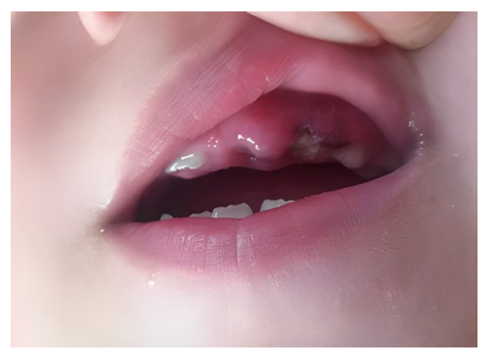
Figure 3. Gingival lesions evaluated by teledentistry