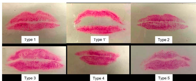
Figure 2: Types of Lip prints

For Finger print pattern, using an ink pad, the left thumb imprint was obtained. It was then transferred to white bond paper and examined under a magnification lens. The most commonly used Michael and Kucken classification 18 —which divides finger print patterns into arch-like, loop, whorl and composite categories (Figure 3) was used to analyse the fingerprints.