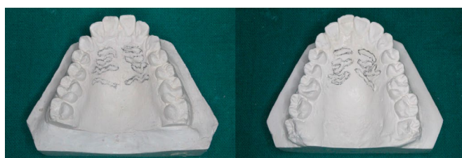
Figure 4: Rugae marked with lead pencil on casts

For Palatoscopy, the rugae region was the focus of the impression of the maxillary arch. After pouring the cast, the rugae area was marked with a lead pencil (Figure 4). The length of each rugae from one end to the other was measured using a divider and a scale to determine its size.