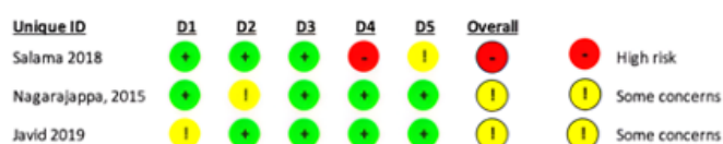
Figure 2. Risk of bias assessment of non-crossover clinical trials included in the study.

From the analysis conducted, one study presented a high risk of bias, and two studies raised some concerns. Regarding the randomization method, the studies by Salama 2018 and Nagarajappa 2015 mentioned having performed this process; however, they did not specify the method used, while the study by Javid raised some concerns in this aspect. The study by Salama 2018 showed some inconsistencies in terms of outcome measures due to insufficient information (Fig. 2).