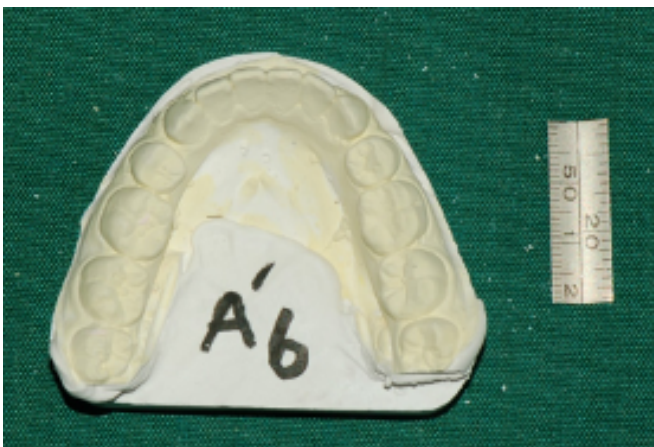
Figure 2. Casts photography with a Nikon camera (model 8010741) at a fixed vertical distance, calibrated using a measuring gauge beside the casts