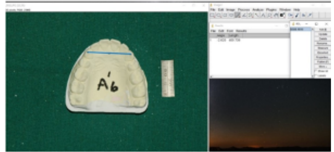
Figure 3. Intercaine Width- the distance between caine cusp tips