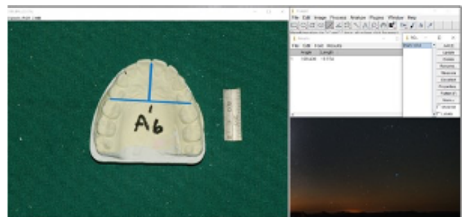
Figure 5. Arch Length- perpendicular distance from the central incisor contact point to the plane by the mesial marginal ridges of first molars