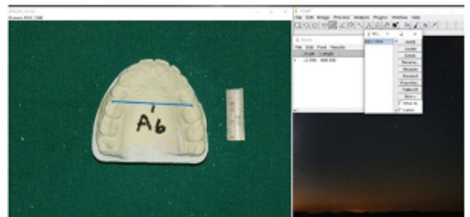
Figure 4. Intercaine Width- the distance between mesiobuccal cusp tips of first molars