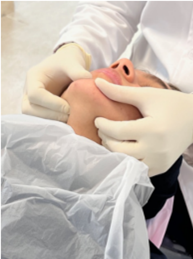
Figure 1. Mandibular positioning into centric relation (CR) using the Dawson Technique