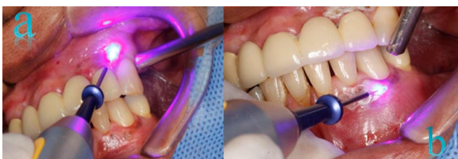
Figure 2. Application of the diode laser: a) Maxillary sector; b) Mandibular sector

Follow-up visits were conducted 3 and 7 days after the procedure, showing adequate healing (Figures 4 and 5). At 12 months (Figure 6), there was no recurrence and no evidence of gingival melanosis.