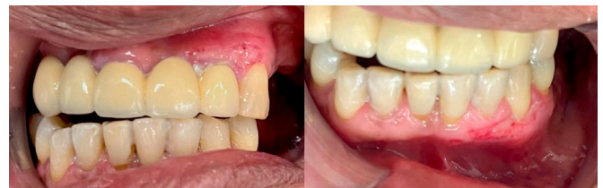
Figure 5. 7-day follow-up. a) Maxillary sector. b) Mandibular sector