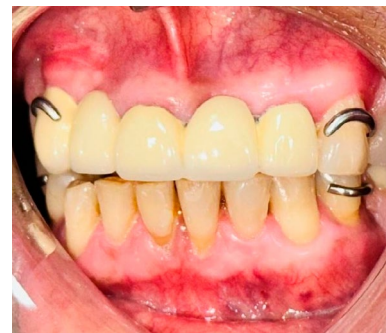
Figure 6. 1-year follow-up. Note the absence of relapses and no evidence of gingival melanosis.