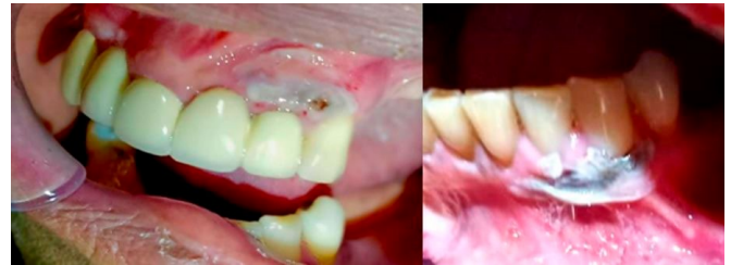
Figure 4. 3-day follow-up. a) Maxillary sector. b) Mandibular sector