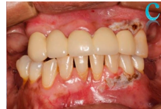
Figure 3. Postoperative surgical immediate