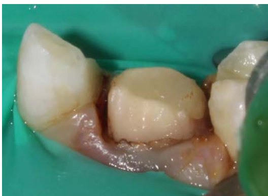
FIGURE 7. A TOOTH IS OBSERVED WITH THE SUBGINGIVAL PREPARATION