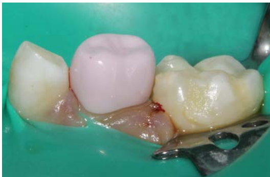
FIGURE 6. SELECT THE "TRY-IN" CROWN NUMBER