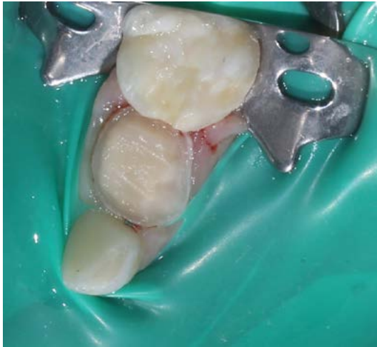
FIGURE 5. THE SUPRAGINGIVAL SHOULDER IS EXPOSED