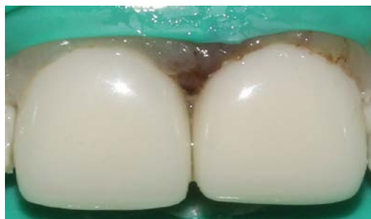
FIGURE 4. FINAL RESTORATION