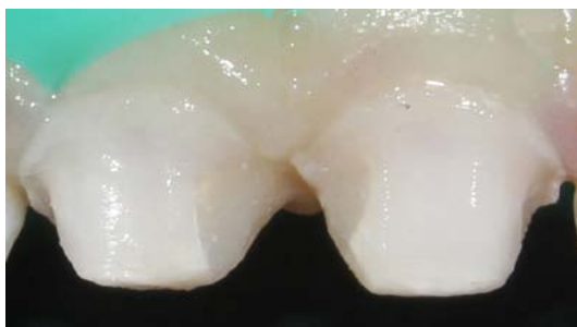
FIGURE 1. A SUBGINGIVAL PREPARATION IS LEFT.