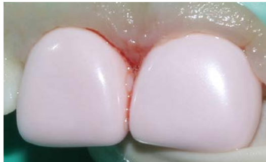
FIGURE 3. SELECT THE NUMBER OF THE "TRY-IN" CROWN