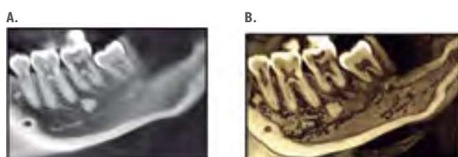
Figure 1. A. 3D reconstruction showing the imaging characteristics of IO visualized as dense, calcified osteosclerotic foci with a homogeneous background. B. Panoramic image of the IO adjacent to the dental roots

Some researchers consider IO as an anatomical bone variant which occurs during development, with no treatment and only follow-up being performed (6,7,11,12,21) .