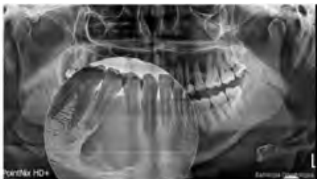
Figure 2: IO of considerable size that includes the mean reference measurements from 33.9 \pm 20.1 \text{ mm}^2 , with a height of 7.7 \pm 3.1 \text{ mm} and a width of 6.6 \pm 3.1 \text{ mm}

In the DPR study IO is shown as avidity, minimal distortion, density and adequate contrast, without the presence of radiographic artifacts or evidence of tumors or trauma. The common characteristics of IO